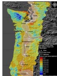
Figure 4. Map of N critical loads for western Oregon and Washington, US. CLs are the amount of N deposition necessary to shift epiphytic macrolichen communities to an air score of 0.21, the point where oligotrophic species comprise 30 to 41% of the community. CLs vary over the landscape because precipitation moderates lichen response. White shading, generally associated with largest urban and agricultural areas and low elevations, indicates likely critical load exceedances from 1994-2002 (air score \geq 0.21). From (2).