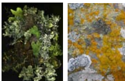
Figure 1. Typical oligotrophic (left) and eutrophic (right) epiphytic lichens of marine west coast forests. Oligotrophs play important ecological roles as forage and nesting materials; eutrophs are smaller, weedy species.

Here, we test the hypothesis that N deposition, precipitation, and lichen community composition relationships are consistent across temperate forests. Using the MWCF model we re-calculate CLs for dry, mesic, and wet temperate forests in CA and Scotland. If they match published CLs then other temperate forest CLs may be predictable using the MWCF model too.