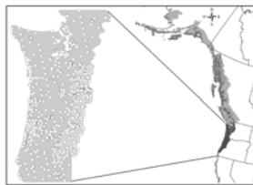
Figure 2. Distribution of western Oregon and Washington lichen survey plots (left) within North America's Marine West Coast Forests (MWCF) ecoregion (shaded area, right).

The MWCF model was developed for coniferous forests of Oregon & Washington using lichen community survey data from >1500 sites (Fig. 2). Survey sites were ordinated using Non-metric Multi-dimensional Scaling Analysis (NMS) and assigned airscores equivalent to their distance along a regional N gradient (2) (Fig. 3). A regression model (3) of air score response to N deposition and precipitation (Table 1) predicted CLs of 3-9 kg N/ha/y (Fig. 4) at air score 0.21, a response threshold of 41-30% oligotrophs and <34% nitrophytes (Table 2), increasing with precipitation.